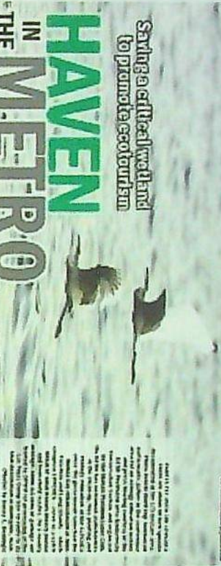
Wetland birds are the primary attraction for ecotourists in the Laguna Atascosa National Wildlife Refuge. The refuge is a critical habitat for many species of birds, including the California condor, the least tern, and the San Diego redwing. The refuge is also a popular destination for birdwatchers and nature enthusiasts. The refuge is located in the heart of the San Diego metropolitan area, making it a convenient destination for visitors. The refuge is managed by the U.S. Fish and Wildlife Service, and it is a member of the National Wildlife Refuge System. The refuge is a vital part of the region's natural heritage, and it is an important resource for the community. The refuge is a beautiful and diverse ecosystem, and it is a great place to enjoy nature and wildlife. The refuge is a must-visit destination for anyone who loves the outdoors and wants to see some of the most beautiful and diverse wildlife in the world. The refuge is a true gem of the San Diego area, and it is a place that everyone should visit at least once in their lifetime. The refuge is a beautiful and diverse ecosystem, and it is a great place to enjoy nature and wildlife. The refuge is a must-visit destination for anyone who loves the outdoors and wants to see some of the most beautiful and diverse wildlife in the world. The refuge is a true gem of the San Diego area, and it is a place that everyone should visit at least once in their lifetime.