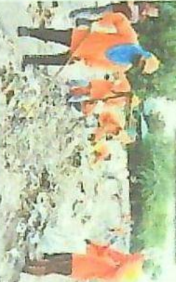
Volunteers participate in a cleanup activity at Laguna Atascosa National Wildlife Refuge, helping to maintain the park's natural beauty.