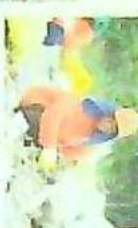
A volunteer works on a conservation project at Laguna Atascosa National Wildlife Refuge, helping to restore the park's natural habitat.

At Laguna Atascosa National Wildlife Refuge, visitors can enjoy a wide variety of recreational activities, including birdwatching, hiking, and fishing. The refuge is a beautiful and diverse ecosystem, and it is a great place to enjoy nature and wildlife. The refuge is a must-visit destination for anyone who loves the outdoors and wants to see some of the most beautiful and diverse wildlife in the world. The refuge is a true gem of the San Diego area, and it is a place that everyone should visit at least once in their lifetime. The refuge is a beautiful and diverse ecosystem, and it is a great place to enjoy nature and wildlife. The refuge is a must-visit destination for anyone who loves the outdoors and wants to see some of the most beautiful and diverse wildlife in the world. The refuge is a true gem of the San Diego area, and it is a place that everyone should visit at least once in their lifetime.