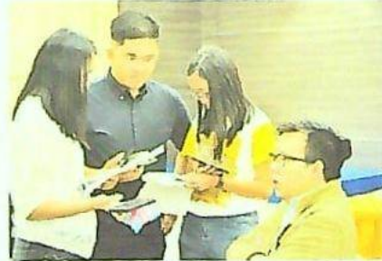
Learn what PH is doing vs. climate change

Villanueva is a communication arts student from Lighthouse of the Philippines-Cavite