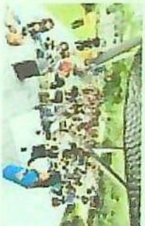
Visitors at Laguna Atascosa National Wildlife Refuge learn about the importance of wetlands and the role of the refuge in protecting the region's natural heritage.