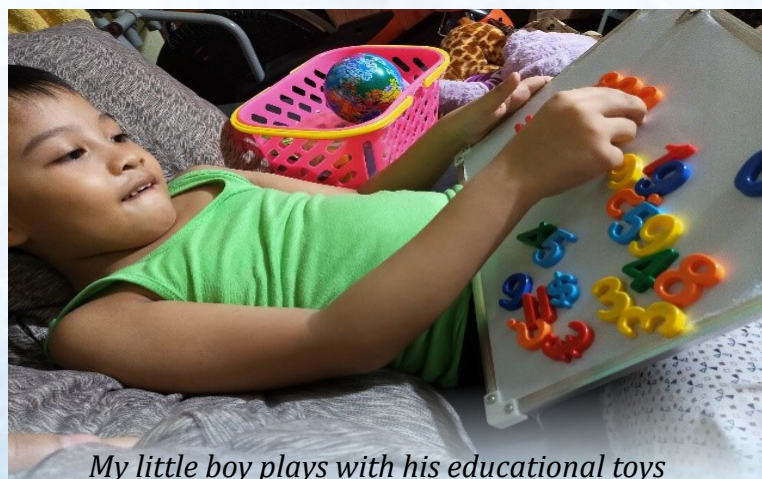
My little boy plays with his educational toys

names of people around them. Make them laugh. Make every learning a life experience. Instead of teaching direct process of addition to kinder, set a make-believe store at home, role play buying and selling goods using addition.